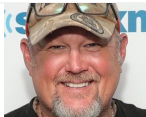
The Real Reason We Don't Hear From Larry The Cable Guy Anymore