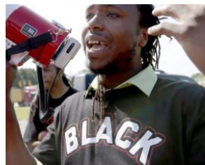
Black Lives Matter Leader Shot Dead