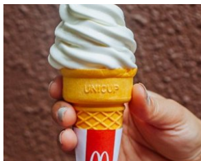
Why McDonald's Ice Cream Machines Always Seem to Be Broken