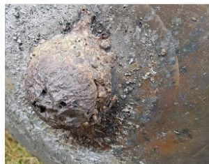
Giant Balls of Metal Are Falling from the Sky Around the World